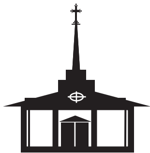
St. Albert the Great Parish